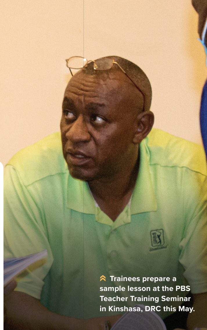
Trainees prepare a sample lesson at the PBS Teacher Training Seminar in Kinshasa, DRC this May.

1. The trainer explains key points. For Leviticus , students are asked to recite the five offerings and the eight feasts described therein. As a summary, the trainer says, “From Leviticus, we need to remember that for our spiritual training, we need to GET RIGHT