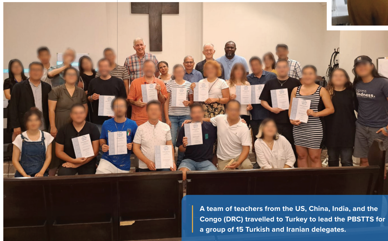
A team of teachers from the US, China, India, and the Congo (DRC) travelled to Turkey to lead the PBSTTS for a group of 15 Turkish and Iranian delegates.