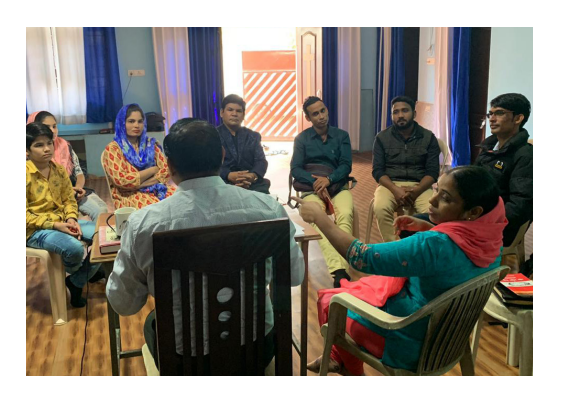
Christian leaders in Bihar strategize on introducing Portable Bible Schools in the neighboring Unreached Villages.