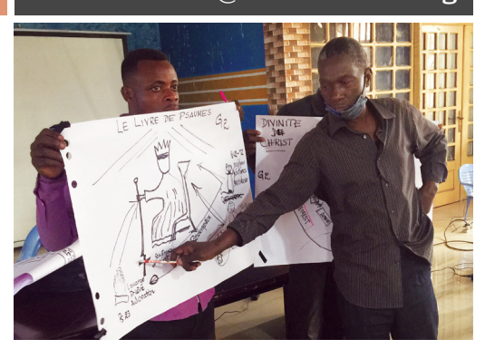
Graduates in Kinshasa utilize drawing to teach the Bible, a technique learned in the Inductive Bible Study training seminar.